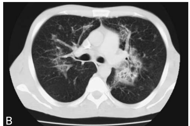
Fig. \frac{1}{2A \quad 2B}