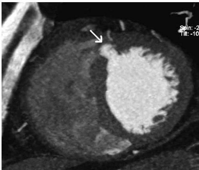
Fig. 2. — MIP short axis view shows an mid anteroseptal located diverticulum (arrow).