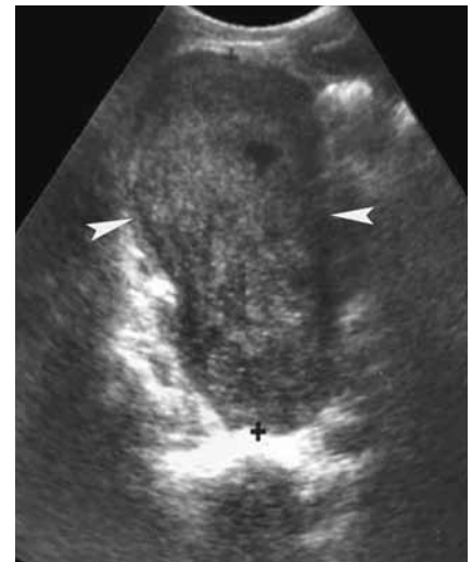
Fig. 1. — Ultrasound of the abdomen showing a large pelvic mass, predominantly solid with a few small hypoechoic areas (arrows).

No efficient treatment regimen has been reported for this type of malignancy. Several case reports suggest different combinations of chemotherapy with variable results. A first attempt was made with a course of chemotherapy: fosfamide, vincristin, and actinomycin, with no results. One month after diagnosis the patient underwent surgery. The pelvic mass and liver lesion were removed. Pathology of the liver lesion confirmed the diagnosis of a metastasis. Following surgery the patient was given one cycle of doxorubicin and cisplatin and one