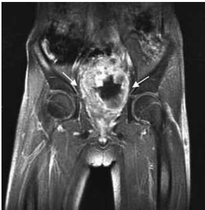
Fig. 3. — Coronal post-gadolinium T1-weighted fat sat image shows a large irregularly enhancing, centrally located pelvic mass (arrows).

and the presence of two new intraperitoneal masses (5.4 x 5.7 x 5.1 cm, 5.3 x 5.2 x 5.7 cm) (Fig. 4) The disease was progressive and chemotherapy was unsuccessful. The patient was given palliative care.