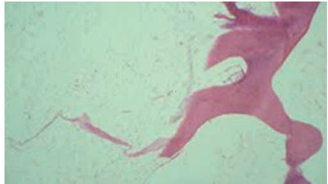
Fig. 2. — HE x16 mature lamellae, bone tissue and mature lipocytes.